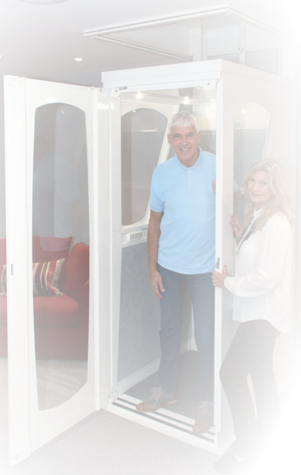
Harmony FE Home Lift

If you haven't previously considered a home lift, speak directly to the manufacturer and join the many customers who are experiencing the convenience and reliability of a Terry Lift. Call 01565 752 800 to ask any question, or to arrange a consultation.