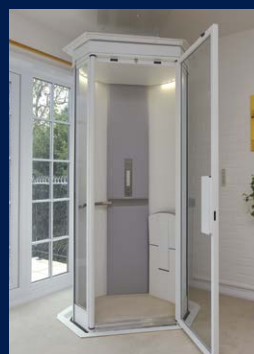
Lifestyle Home Lift

If you haven't previously considered a home lift, speak directly to the manufacturer and join the many customers who are experiencing the convenience and reliability of a Terry Lift. Call 01565 752 800 to ask any question, or to arrange a consultation.