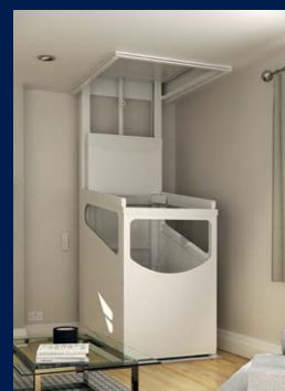
Harmony Home Lift